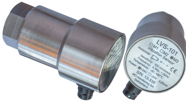
LVS-101 M3 model